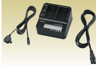
AC Adaptor/Charger AC-VQV10 (AC 100 V - 240 V)