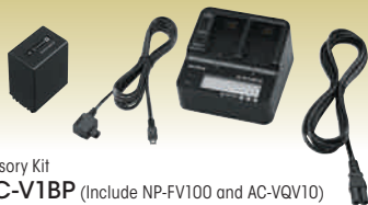
Accessory Kit ACC-V1BP (include NP-FV100 and AC-VQV10)