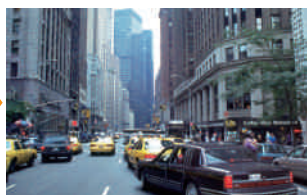
26.3 mm (HXR-NX70U)