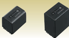
Rechargeable Battery Pack NP-FV70 (6.8 V / 14.0 Wh / 2060 mAh) NP-FV100 (6.8 V / 26.5 Wh / 3900 mAh)