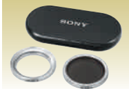
PL Filter Kit VF-37CPKB (When shooting through reflective surfaces) * Must remove supplied lens hood.