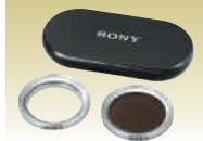
ND Filter Kit VF-37NKB (When shooting in extremely bright sunlight) * Must remove supplied lens hood.