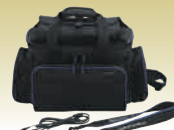
Accessory Kit ACC-V1BP (include NP-FV70, BC-TRV, RM-VD1 etc)