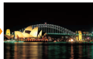
HXR-NX70U (Exmor R)